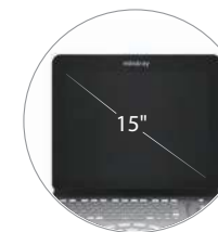
15 inch Full Screen design