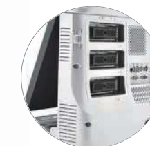
Max 3 universal transducer connectors