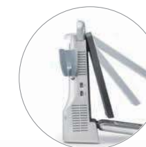
60 degree tilting angle adjustable monitor